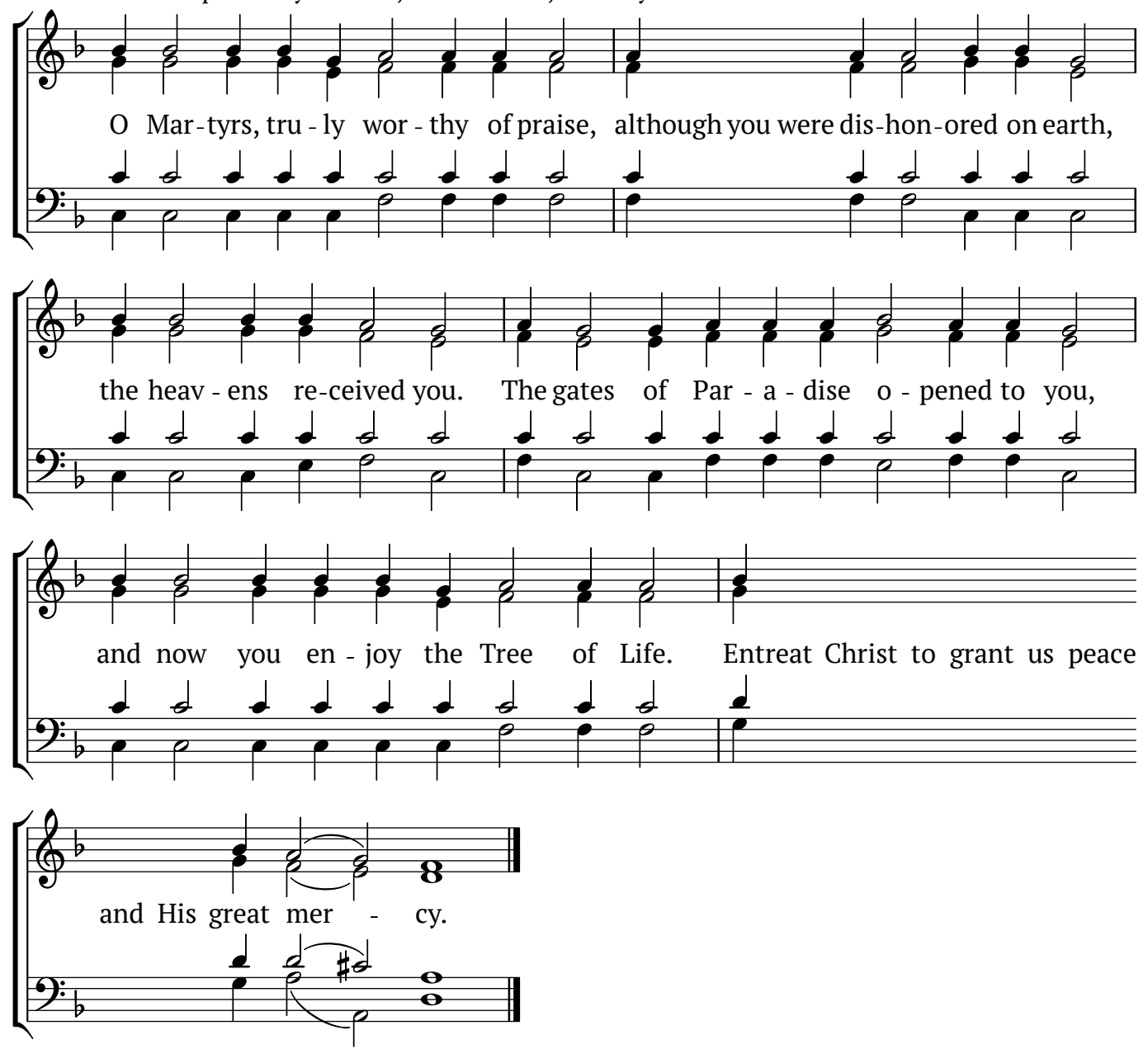
For the Apostles, by Joseph In the third tone

8. Out of the depths I cry to Thee, O Lord. Lord, hear my voice.